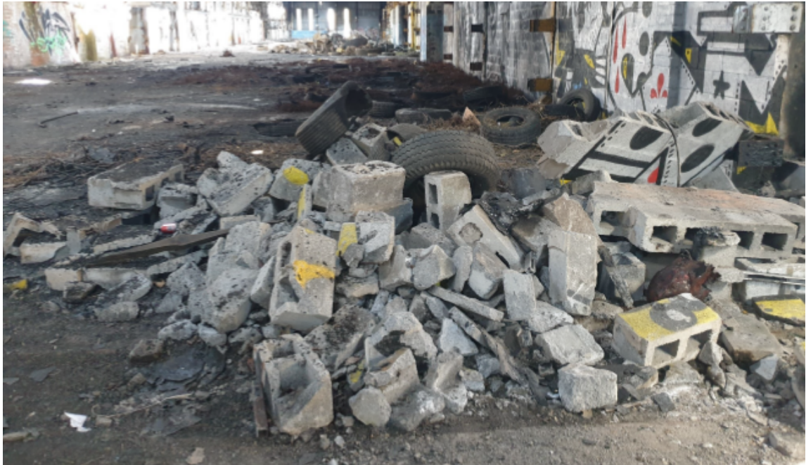
Above - July 2019