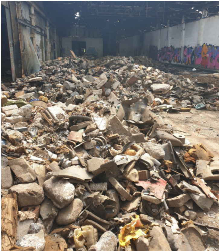
Left - August 2019.